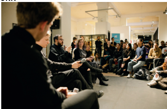
ENGAGE WITH SCIENTISTS, JOURNALISTS, NEW TALENTS, AND THE BROADER PUBLIC