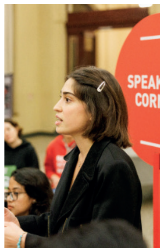
PROMOTE YOUR ORGANISATION'S WORK

We want our visitors to immerse themselves in a great festival experience, to acquire connections and expand their knowledge. We are open to varied and creative suggestions that can contribute towards making the CAMPUS a central place for networking and exchange - from events related to science to networking formats, receptions or academic speed dating. Get in touch and let's discuss your ideas!