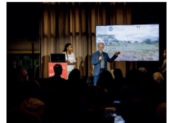
Deep Dive Forum