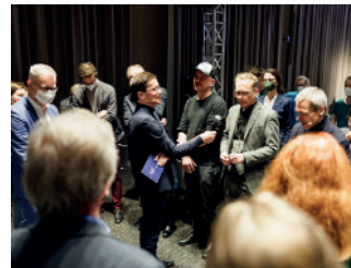
New Normal Hall