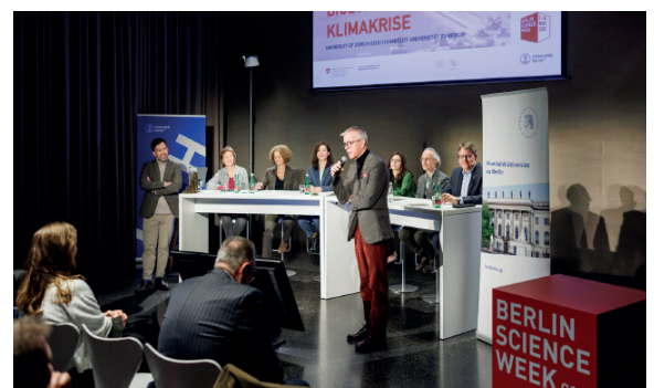
CONNECT WITH AN INNOVATIVE AND INTERDISCIPLINARY COMMUNITY